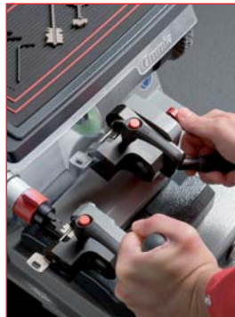
Smooth carriage movements

Silca is always close to its partners. The QR Code attached to the machine's side enables you to watch useful tutorial videos directly on your smartphone, helping you out with maintenance operations and installation of optional accessories.