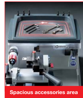
Spacious accessories area