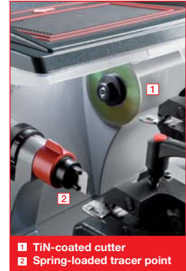
1 TiN-coated cutter 2 Spring-loaded tracer point

The integrated accessories area on top of the machine is particularly wide and capacious, allowing you to easily place accessories and keys. The incorporated tool holder dedicated to female keys tailstocks (optional) guarantees quick identification and immediate finding of the right accessory. Swarf collection in the dedicated tray,