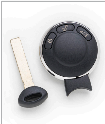
Emergency key HU200

Silca is pleased to introduce a new reference for duplicating Mini® slot keys: the perfect solution for replacing damaged or lost keys, or to have a duplicate in case of emergency.