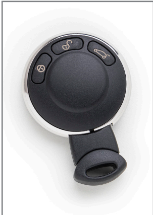
Slot key HU200S22