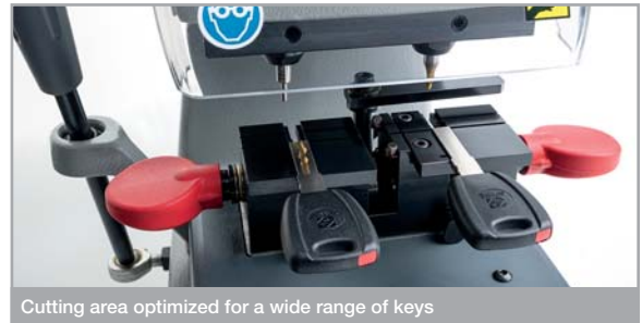
Cutting area optimized for a wide range of keys

cutting results even when original keys are worn out.