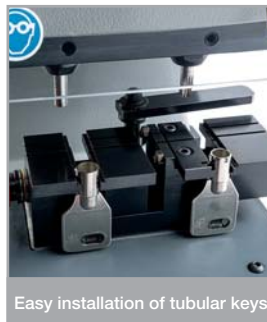
Easy installation of tubular keys