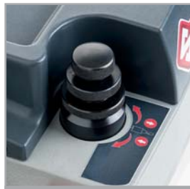
Ring nut for tracer adjustment

The machine is equipped with sprung tracer point and adjustment ring nut for the perfect calibration of dimple keys. This ensures quality