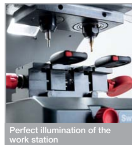
Perfect illumination of the work station