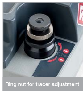
Ring nut for tracer adjustment