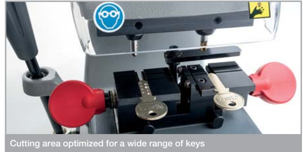
Cutting area optimized for a wide range of keys

The levers and knobs of the machine are made of engineering plastics and, thanks to their ergonomic shape, guarantee comfortable grip and handling. The carriage shifting via rods and bush-